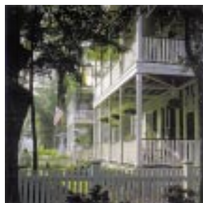
I'On, South Carolina